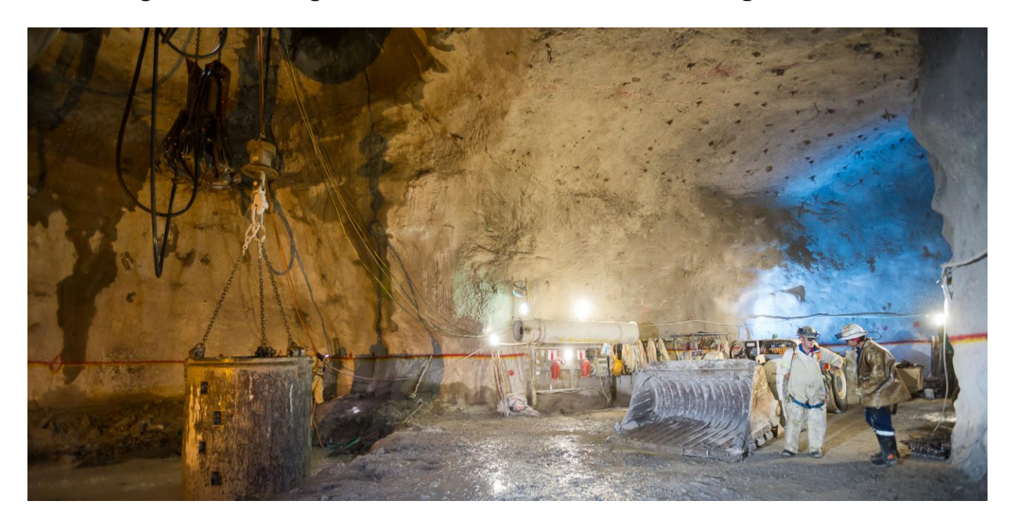
Ongoing development work at Shaft 1's 850-metre-level mine access station, showing the northern top-cut excavation.

The northern excavation at Shaft 1's 750-metre station, showing the large scale of the underground workings – ideal for safe, mechanized mining.